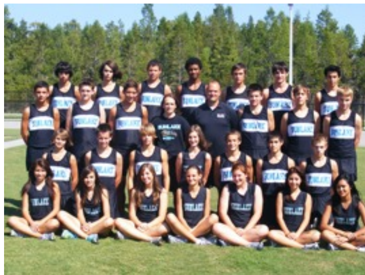
The Cross Country team considers themselves a family.

In order to prepare for this event, they had to train every day. The team went to various trails including Lake Rogers Park, where something unexpected occurred.