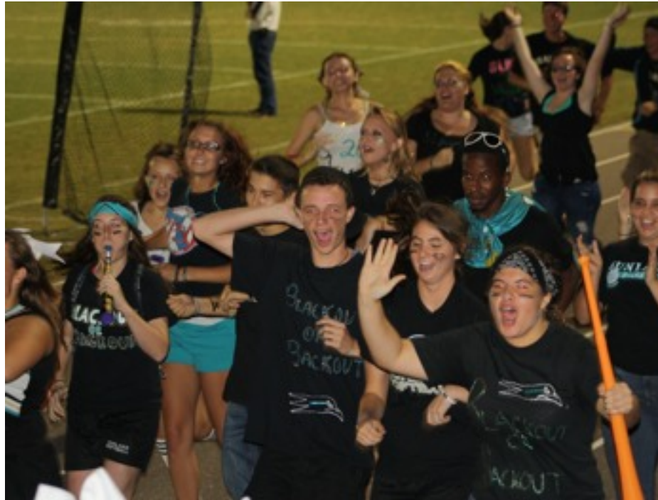
School spirit has been at an all-time high this season.