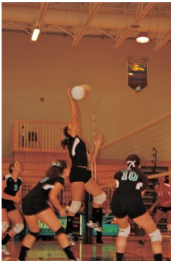
A Lady Seahawk spikes the ball over the net as her teammates rally to support her.